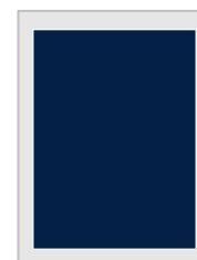
1/1 full page